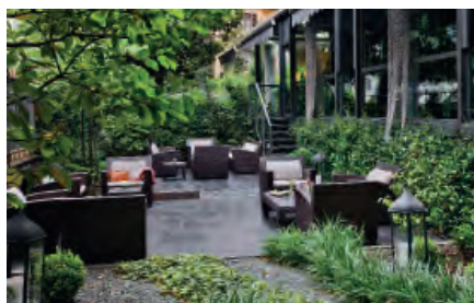
Baglioni Hotel Carlton, Milan

The Villa Belvedere is a charming and comfortable hotel, centrally located in the town of Taormina. Occupying a historic Sicilian villa, the hotel's position perched high on the hill-side offers stunning views across the bay and the countryside towards Mount Etna. The bedrooms are simple but pretty, and several of them have balconies with table and chairs. Tasty light lunches are served on the terrace by the pool, whilst there is a delightful choice of restaurants within easy reach in the town.