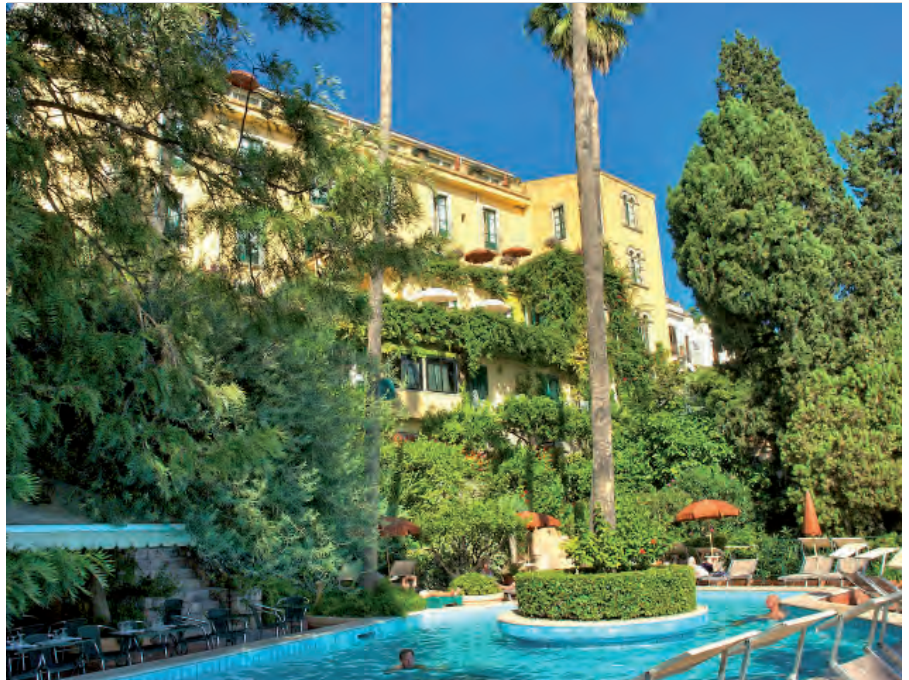
Villa Belvedere, Taormina

You leave Naples behind just before 10.00am to travel by train to Taormina-Giardini, following the dramatic coast south through Campania, Basilicata and Calabria to reach the Strait of Messina where your train boards the ferry for the crossing to Sicily. Arrive into Taormina late afternoon and transfer to the Hotel Villa Belvedere where you spend three nights.