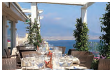
Grand Hotel Vesuvio, Naples